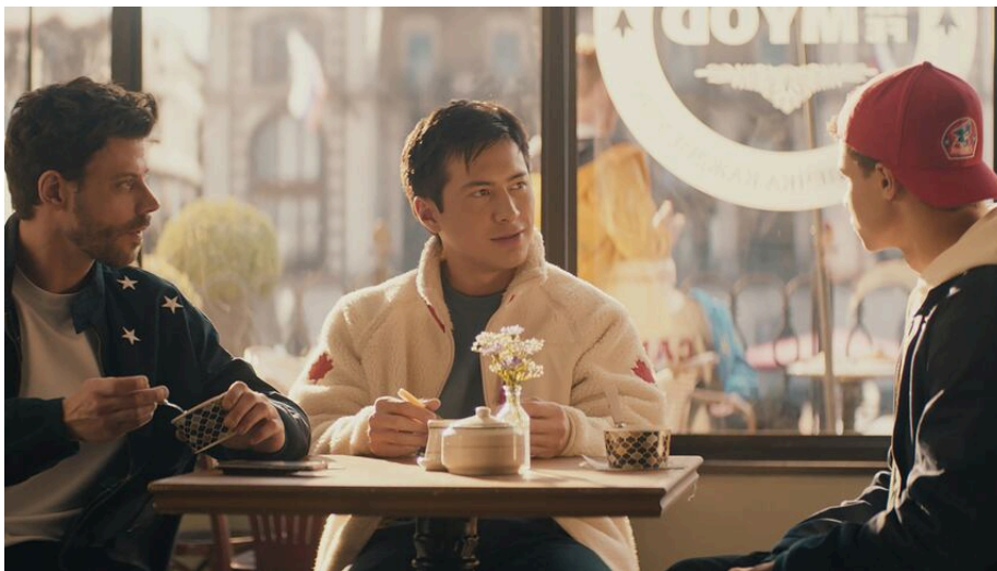
François Arnaud as Scott Hunter, Hudson Williams as Shane Hollander, and Kolton Stewart as Carter Vaughn in the second episode of Heated Rivalry.