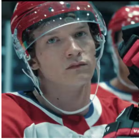
There's Very Little Hockey In 'Heated Rivalry'