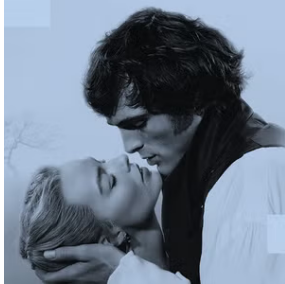
Fans Are Losing It Over the New 'Wuthering Heights' Trailer